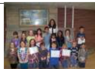
Spelling Bee Winners 2011