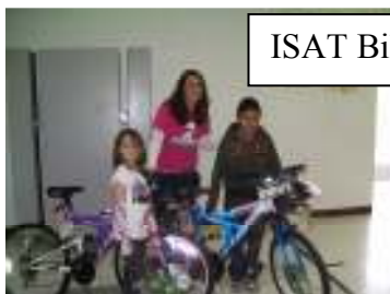
ISAT Bike Winners

Children's Health & Safety Fair at McHenry County College 8-3-11 from 9-4. Low cost physical and dental exams and immunizations. For more info call: 815-334-4500.