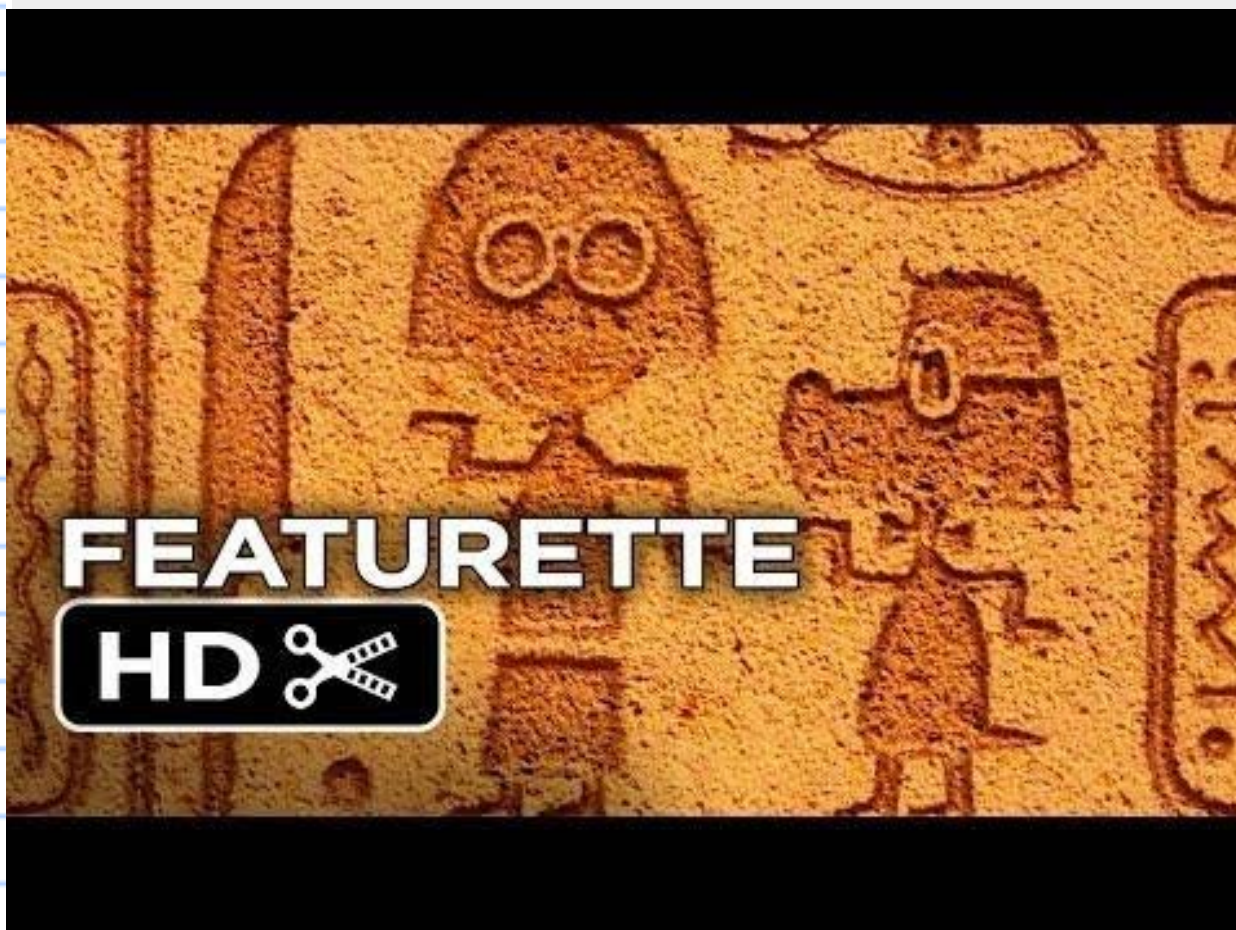
Peabody and Sherman